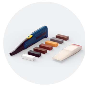
Repair kit QSREPAIR

A sturdy microfiber mop, machine washable up to 60 °C. This mop is compatible with the Quick-Step Cleaning kit.