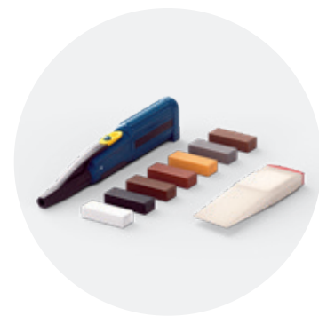
Repair kit QSREPAIR