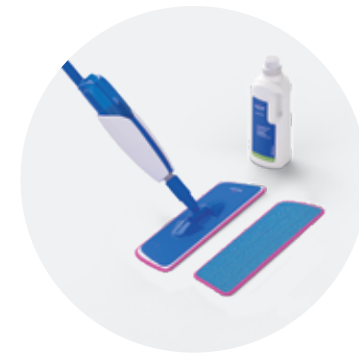
Cleaning kit QSSPRAYKIT